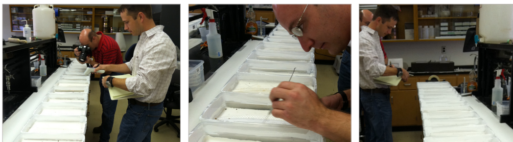
Members and staff of Texas A&M University College of Agriculture and Life Sciences, Department of Urban Entomology, review the mortality results of bed bugs after using the Jiffy Steamer X-Series.

You can Jiffy steam a queen-size bed in minutes. Allow time for bedding to air dry, and vacuum the mattress to remove the dead bed bugs.